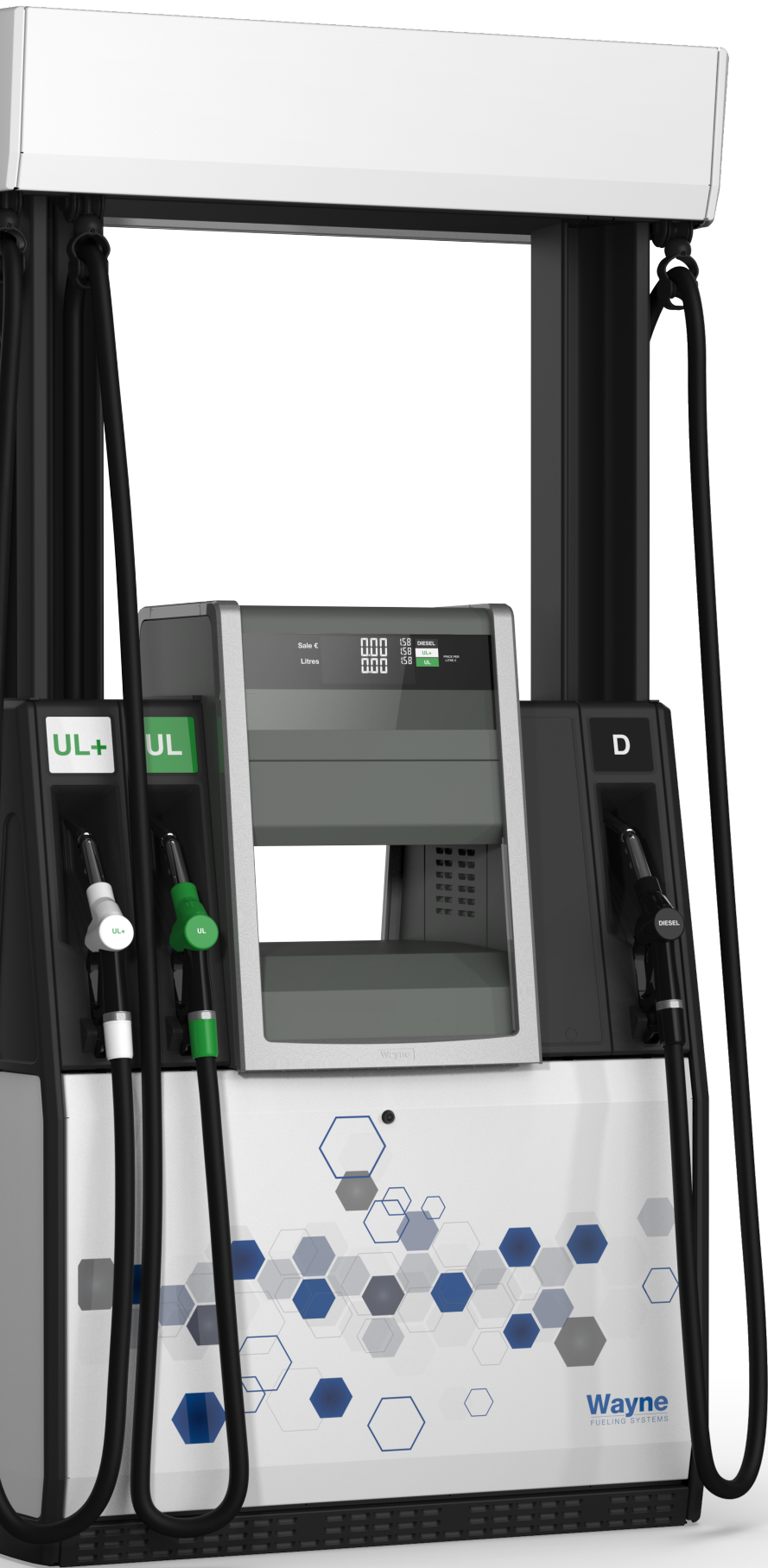
Wayne Helix™ 5000 II fuel dispenser